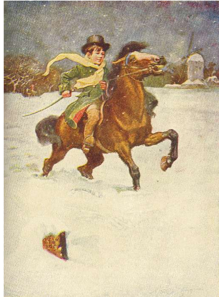
HIS PONY AND HE STRUGGLED ON.

On his return to the dormitory he laid down the spoil before his companions, who had often coveted the fruit, but had not dared to take it because of the severe flogging which would probably follow. Our hero refused to eat a single pear, for greed had not prompted his daring action.