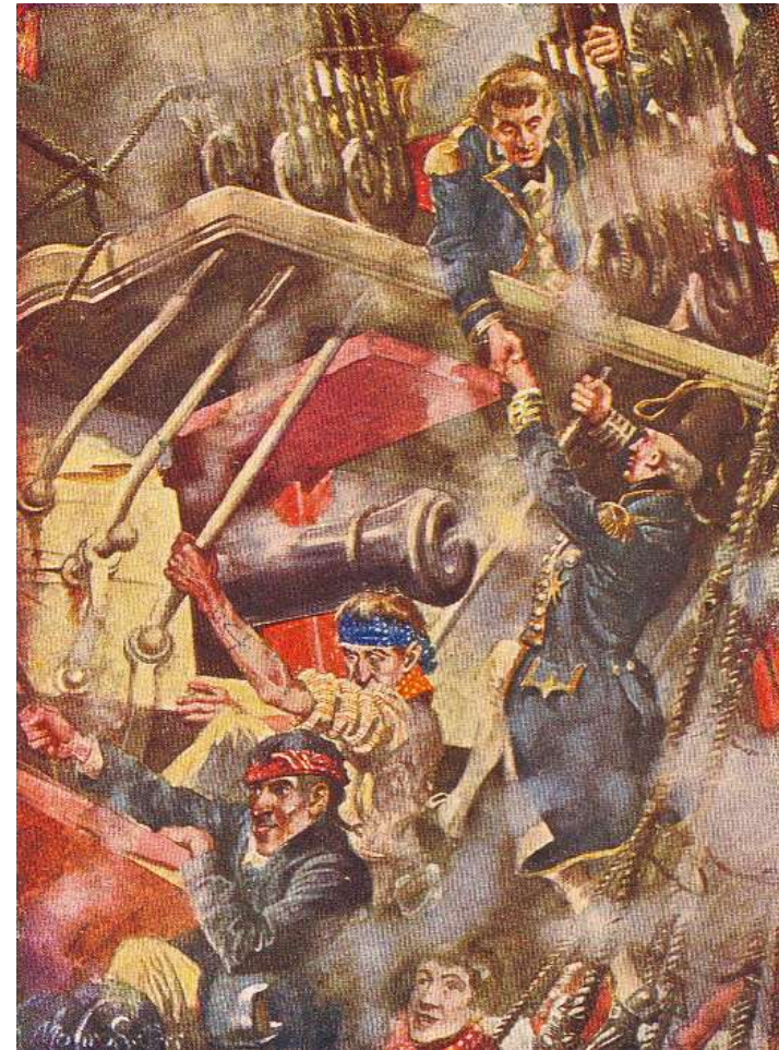
BERRY HELPED NELSON INTO THE MAIN-CHAINS OF THE SAN JOSEF .

Cheer after cheer rose from the Victory , and the ringing huzzas were taken up by the whole fleet.