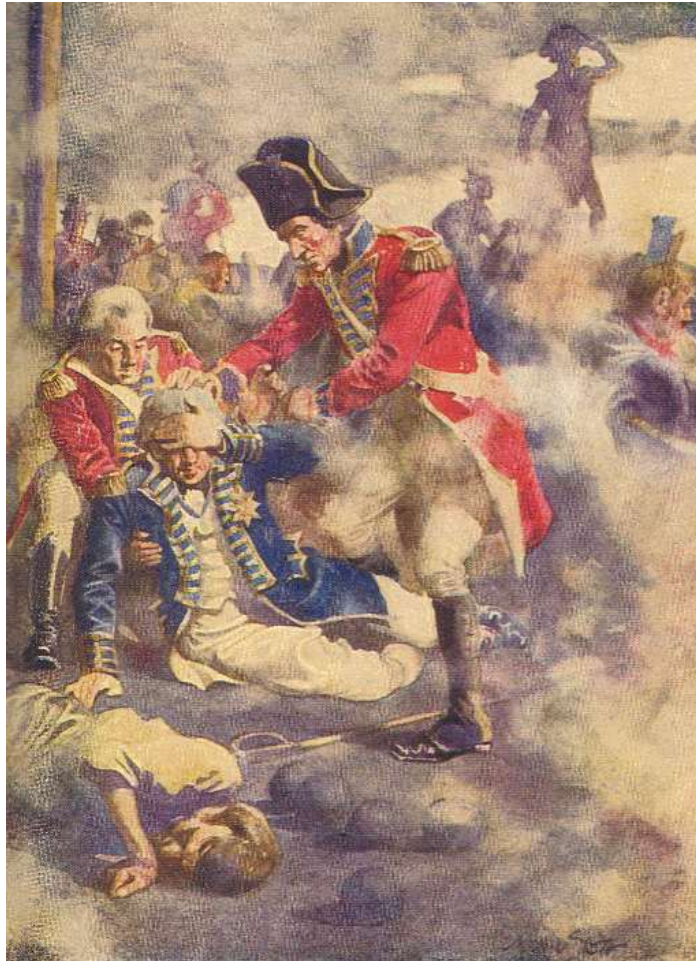
NELSON WOUNDED AT CALVI.

Rhine. In Spain also France was victorious, and Italy was soon to be crushed. The fate of Europe hung in the balance; Bonaparte and his conquering armies seemed to have cast a great shadow of fear and oppression over the nations, and all eyes were turned upon England and her sea power as the one means of saving Europe.