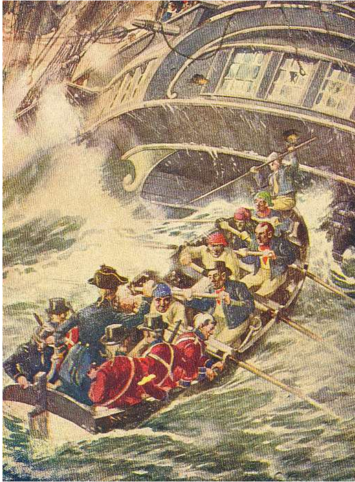
THERE WAS A HEAVY SEA RUNNING.

this time at war with both France and Spain, and there was a great deal of fighting on shore, in which Nelson had his share and showed great courage.