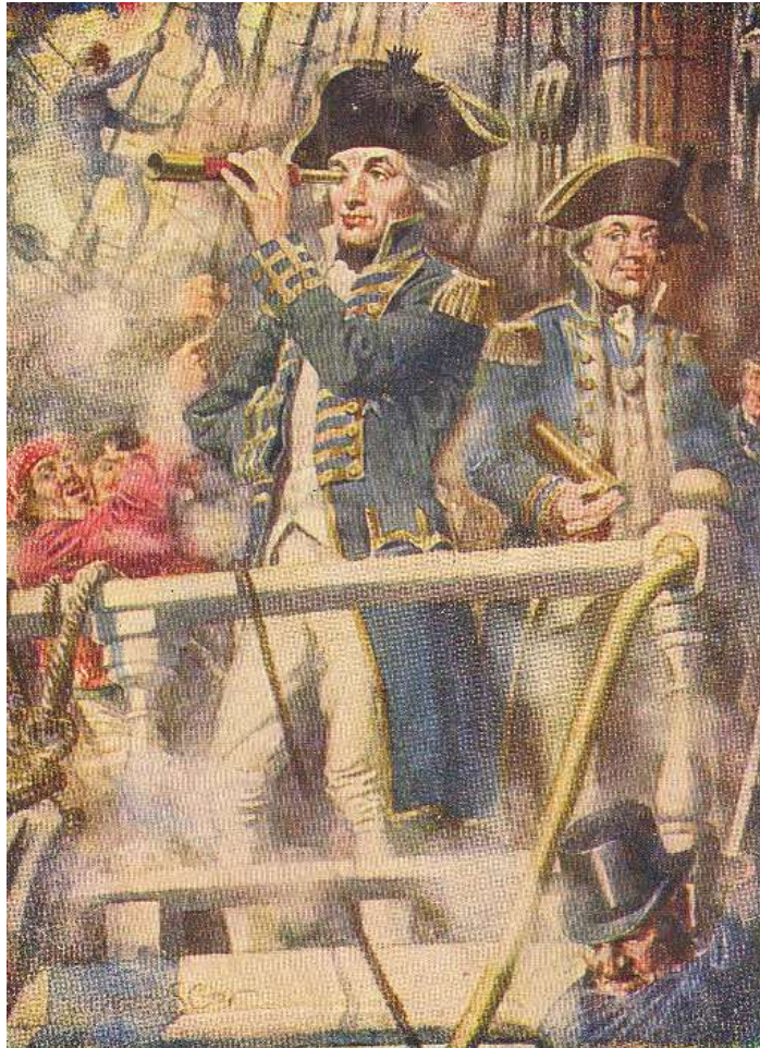
NELSON AT THE BATTLE OF COPENHAGEN.

By two o'clock the Danish fire had slackened; half their line were wrecks, the floating batteries were either sunk or nearly silenced; their flagship was ablaze.